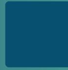
PANTONE 3025 C