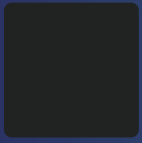
PANTONE 419 C