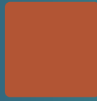
PANTONE 7592 C