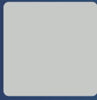
PANTONE 420 C