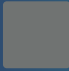
PANTONE 424 C